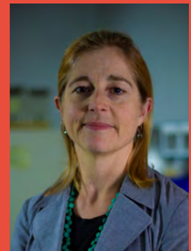
Senior Forensic Anthropologist, Victorian Institute of Forensic Medicine